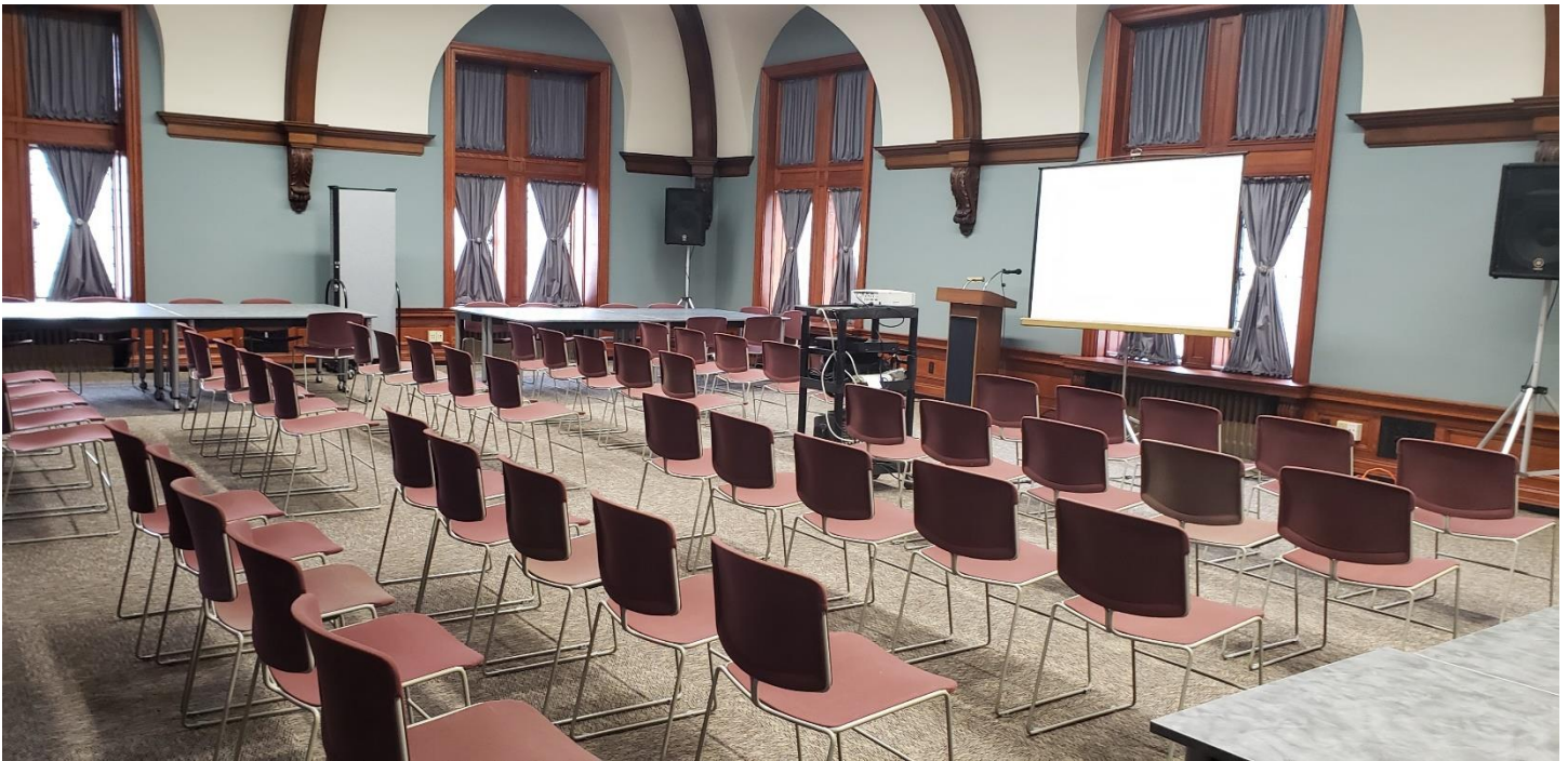
Henkelman Room, Theater Style. Seats up to 60 attendees.