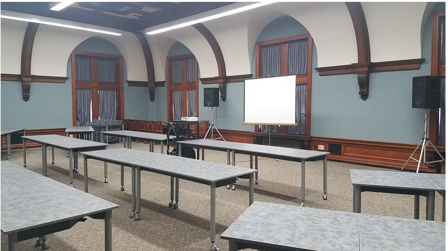
Henkelman Room, Classroom Style. Seats up to 50 attendees.