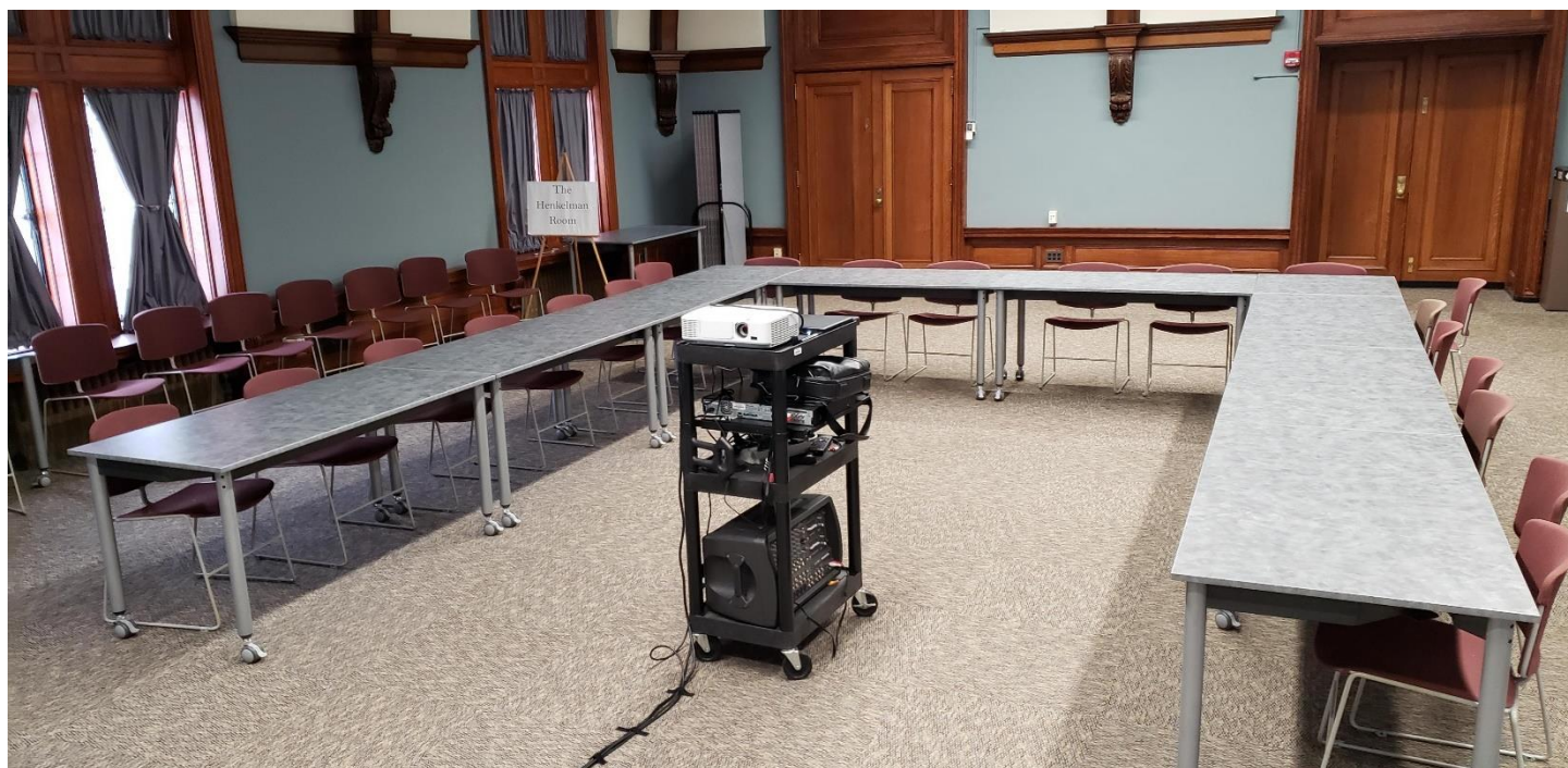
Henkelman Room, U-Shape. Seats up to 35 attendees.