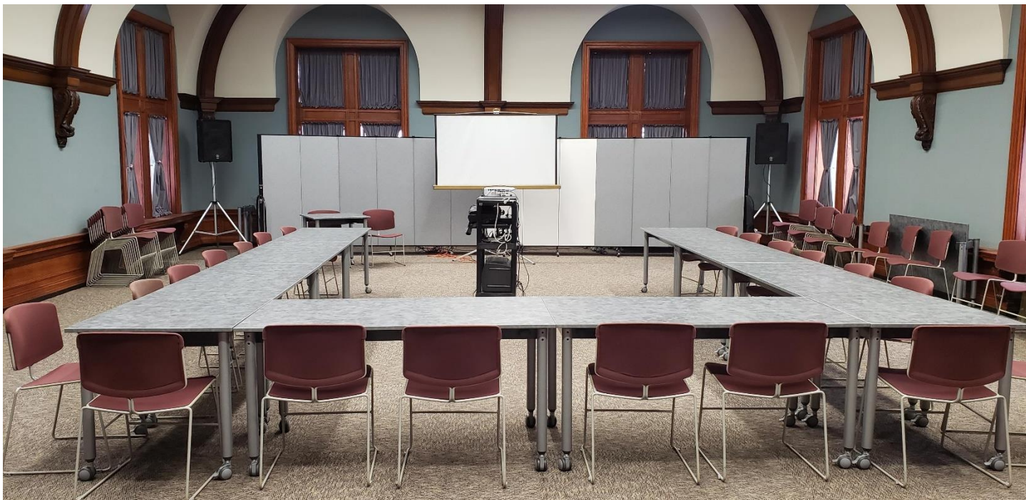
Henkelman Room, U-Shape, facing away from door entrance. Seats up to 35 attendees.